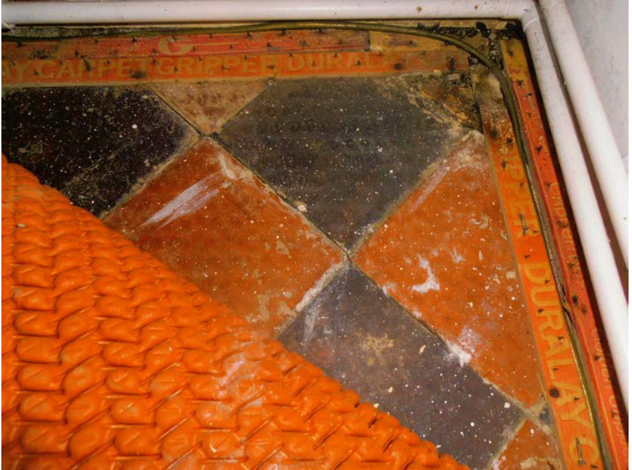
Old quarry tiled floor

Conservation Officer. It is therefore our opinion that you should adequately protect any perishable floor coverings with water resistant underlays.