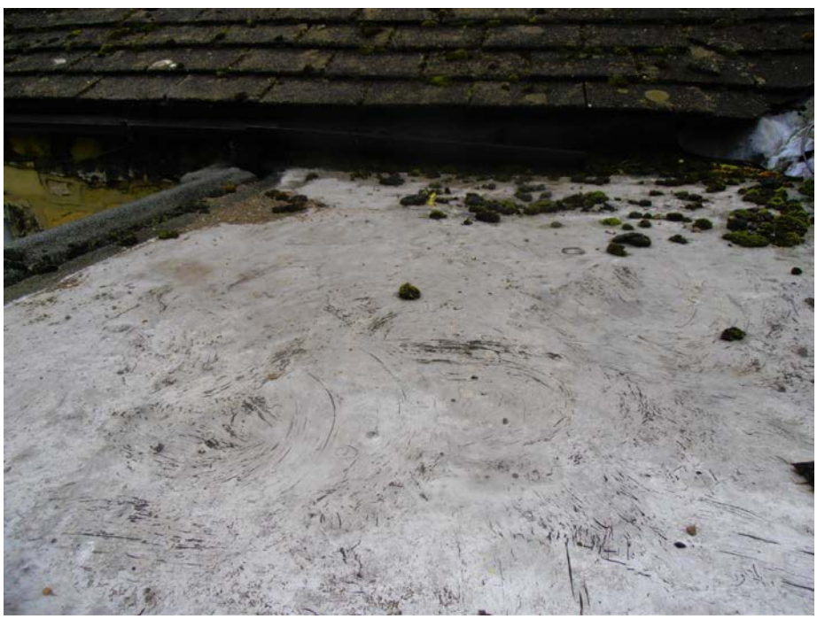
Flat roof surface

Concrete flat roofs are more durable than traditional timber roofs. However, any flat roof is susceptible to leakage and damp penetration. It is therefore important that the felt linings are kept in good condition.