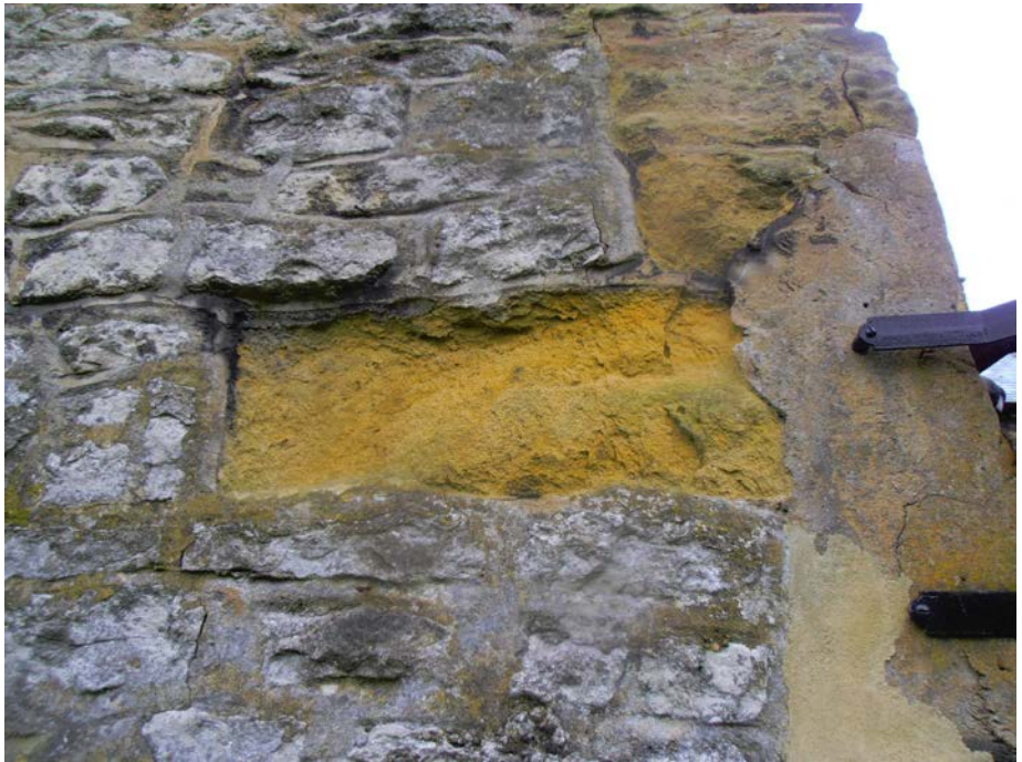
Weathered sand stone

The external elevations appear to be formed from a mixture of lime stone and sand stone. Fairly noticeable weathering has occurred to several sections of sand stone, which is a more fragile material. At present, the level of deterioration is not considered structurally significant. However, the most noticeable weathering was found to the northern elevation around the master bedroom en-suite, which is causing internal damp penetration to occur. You should ask a competent building contractor to provide a quotation for applying an external protective coating or chopping out and replacing the severely weathered stones in full. Any works of this nature should be carried out with local authority approval.