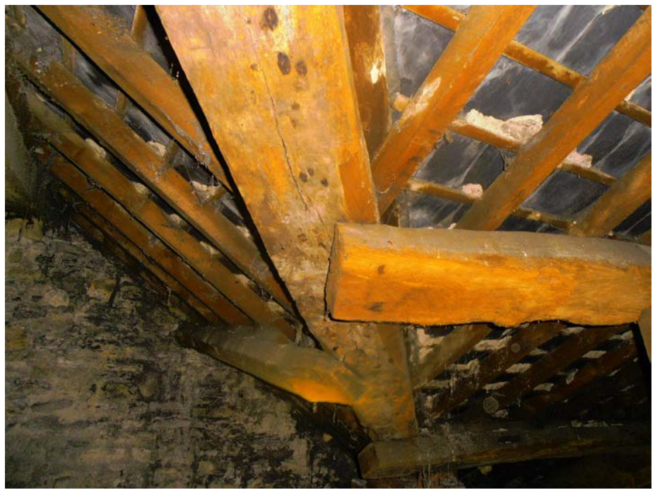
Purlins requiring improved supprt

<u>ACTION:</u> Have a structural engineer provide a scheme of structural improvements to the main roof void. Obtain quotations for these works which may necessitate the removal of external roof coverings.