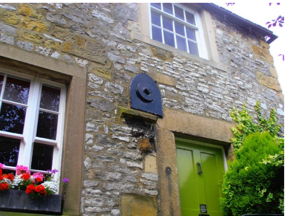
Structural tie to right hand elevation

any serious future structural movement that may occur, is covered by your house insurance policy.