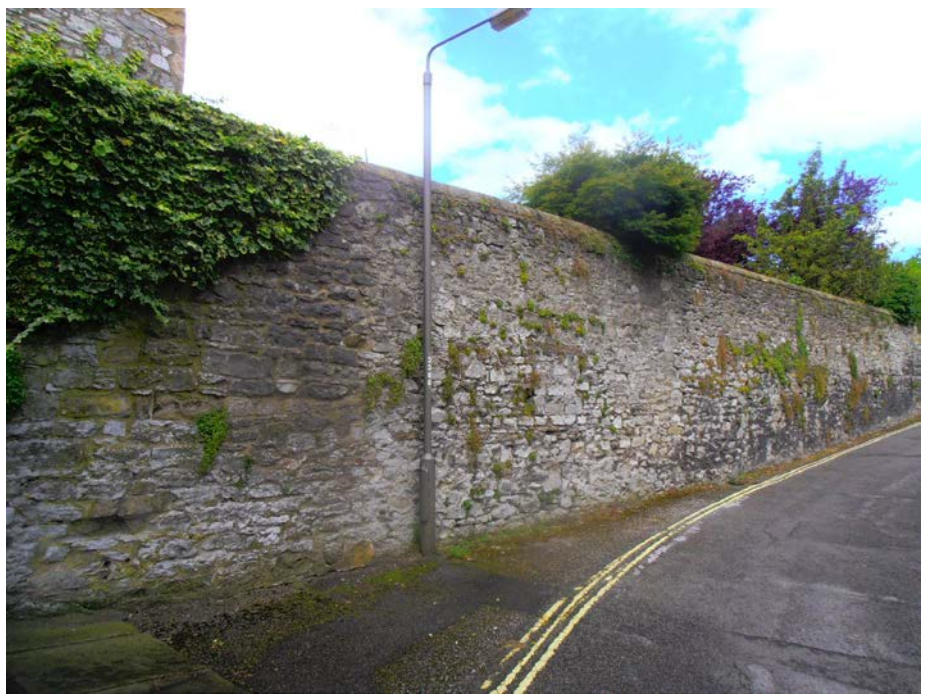
Large retaining walls

There are large retaining walls to either side of the rear garden. In order to preserve the condition of these walls, you should consider maintenance within the next 2 years. It would therefore be sensible to consider re-pointing these walls within this time period.