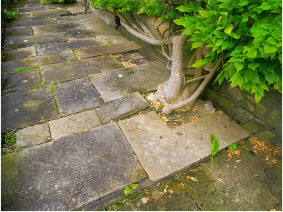
Damage to paving at front

It is understood that the path to the right hand side of the property is owned by the subject property. There is therefore an apparent public right of way into the church. This should be clarified by your legal adviser.