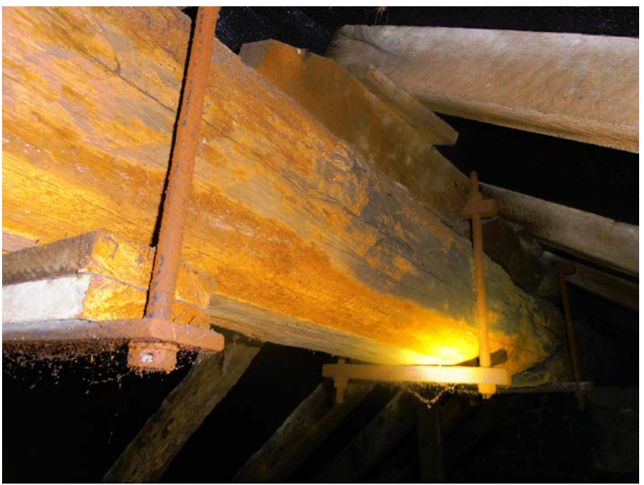
Deteriorated ridge board with partial repairs

consider introducing a felt lining beneath these coverings when re-roofing is undertaken in the future.