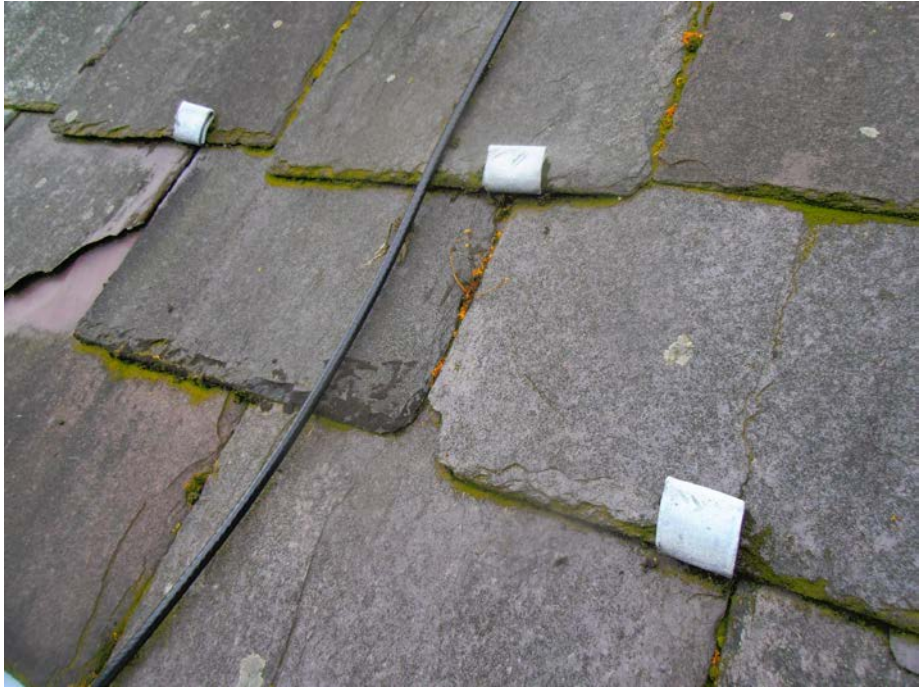
Metal tingles re-securing slates

slipping slates will increase, as more nails rust through and at that time a decision will have to be made as to whether it would be more cost-effective to take up the slates and re-lay them, using new fixings.