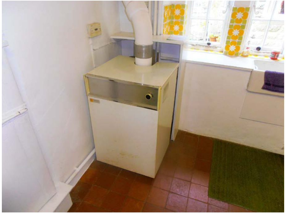
Old floor mounted boiler

The central heating boiler is formed by a fairly old floor mounted gas fired unit located within the utility room. The boiler utilises a vertical flue which extends within the chimney breast. The accessible parts of the flue within the utility room appear to be formed from asbestos cement.