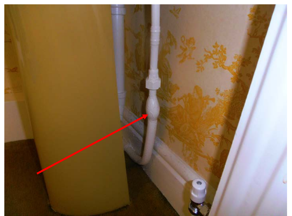
Lead plumbing to bathroom

As there is lead within accessible parts of the property, you should also budget for lead pipes within presently concealed areas. A competent plumbing contractor will therefore need to expose all areas of plumbing, and budget for replacements. As a worst case scenario, you would be sensible to budget for complete re-plumbing if you are considering replacing kitchen and bathroom fittings.